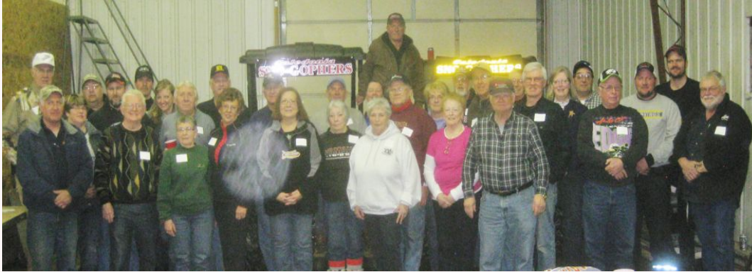
Dogs and Sno-Gophers at their clubhouse

The afternoon of February 1 st . the doors of the Crest Motel began opening and closing as we arrived in Caledonia, located in the far Southeastern corner of Minnesota, for our 2014 Midwest Iron Dog ride. We quickly unloaded our sleds off the trailers to be ready for riding the next day and headed for the party room to be ready for the Super Bowl. But, the delight of being together and the anticipation of the morning's ride diminished the interest in the game. Maybe it wasn't such a hot game anyway.