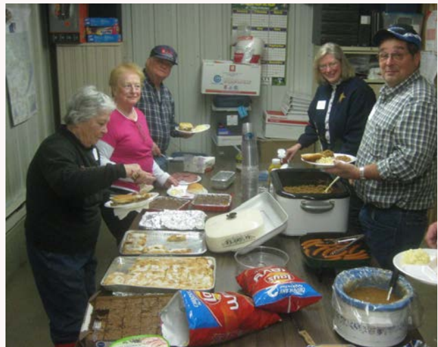
Dinner and social at the Caledonia Sno-Gophers Clubhouse.