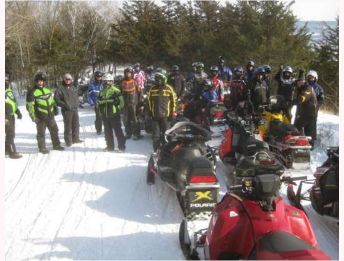
Our band of Dogs and guests.