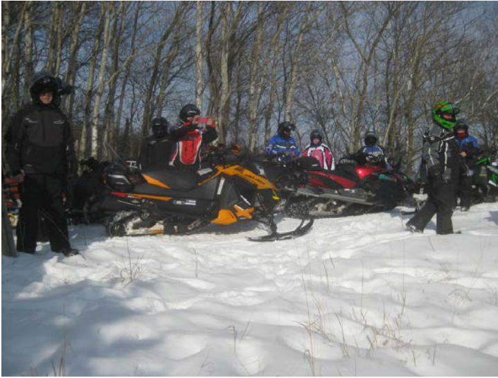
Group stops for a break and photo op at a scenic